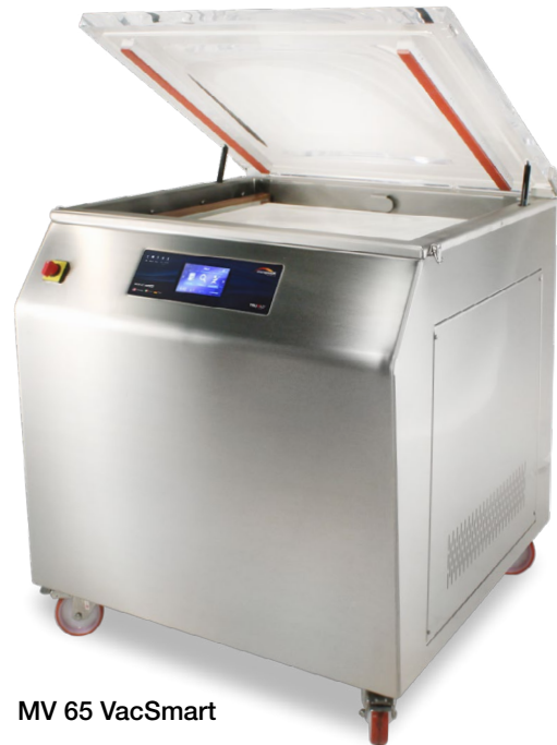
MV 65 VacSmart